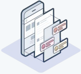
Solutions Partner Package