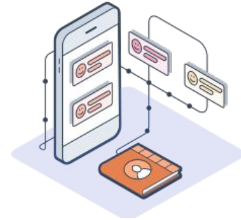
Solutions Provider Package